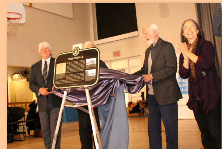
Unveiling a historical plaque at McKee Public School