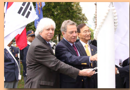
Raising the flag at Queen's Park on Korean National Heritage Day